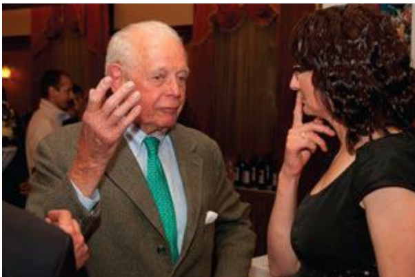
16 March 2011 Fiends of BCAF – 15 years later

The people, who have been a part of BCAF's management team during the last 15 years